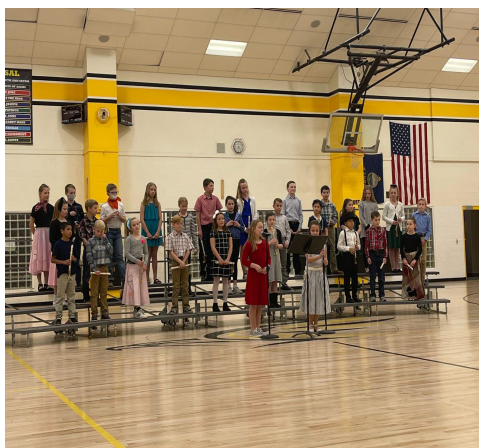
The fourth grade performs songs on their recorders.

"Beauty and the Beast Jr." will be performed Friday, April 29th, Saturday, April 30th, and Sunday, May 1.