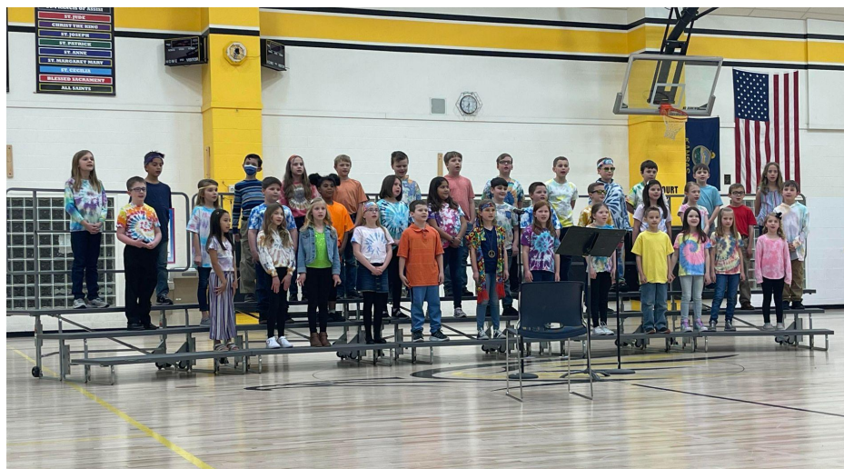
The St. Peter third grade students sing a cover of "Meet The Flintstones."