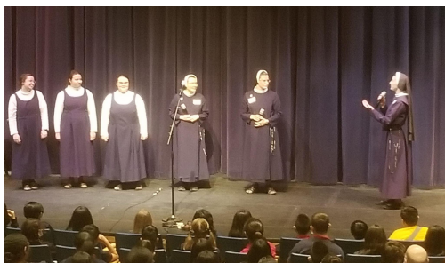
The IHM Sisters spoke about the essential elements of religious life.