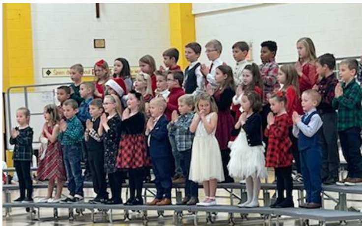
First grade students sing "O Come Little Children" at their Christmas concert on December 14.