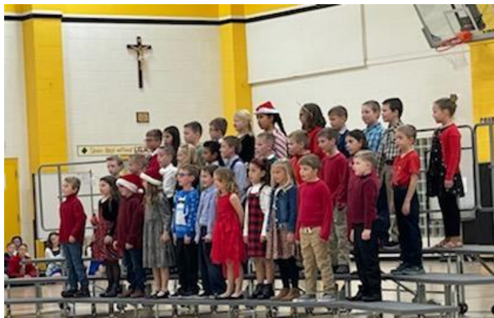
The second grade students perform "Little Drummer Boy" at the Christmas concert.