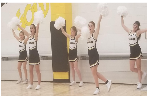
St. Peter cheerleaders show their Eagle spirit at the girls home basketball game.